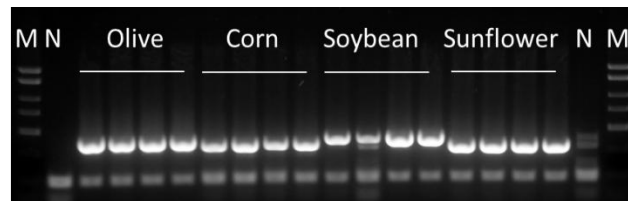
Figure 3. Lec-294 amplicons run on 1.4% agarose TAE gel following end-point PCR. The DNA samples were isolated from store bought seed samples using Norgen's Plant/Fungi DNA isolation kit. N = no template control. M= FastRunner DNA Ladder.